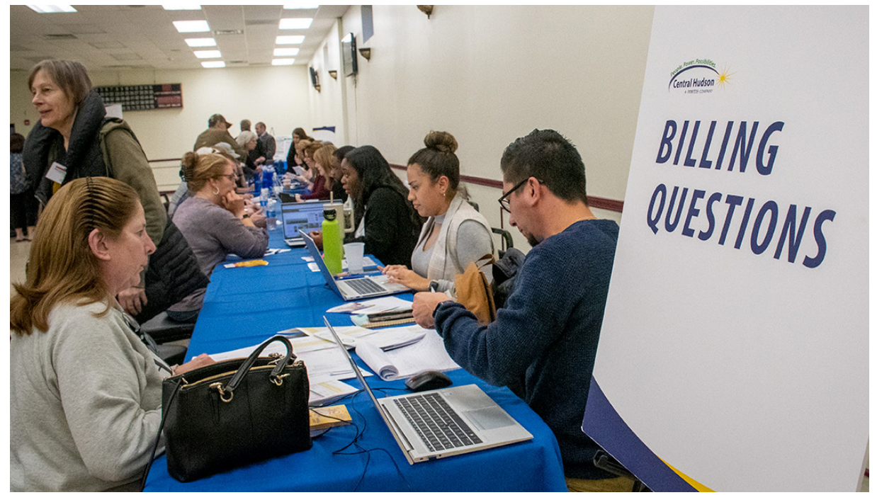
Central Hudson hosted an open house at the Elks Club in Catskill on March 23. The Company hosted open houses in each of its five districts to assist customers with billing questions.

Since implementing its new Customer Information System in September 2021, Central Hudson has worked to expand its total workforce by more than 10 percent. In addition to the new positions, Central Hudson has also taken the following steps to increase accessibility and resolve