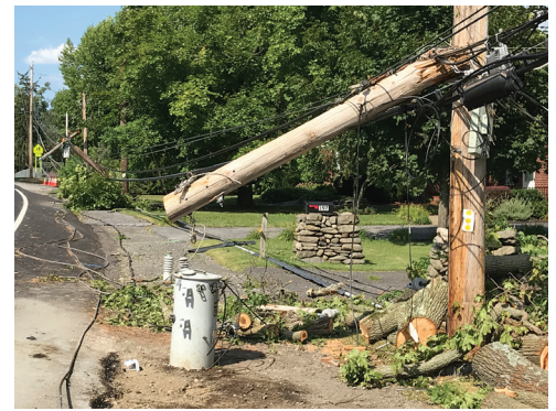
Central Hudson crews worked day and night to restore service to the 117,000 homes and businesses affected by Tropical Storm Isaias.