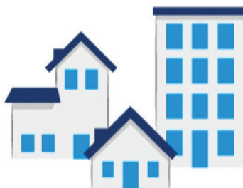
Subscribers agree to purchase the clean energy from this plant at a discount