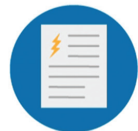
Subscribers receive a credit on their utility bill with no change in service