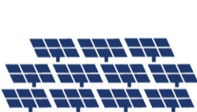
Local energy plant generates clean, renewable electricity